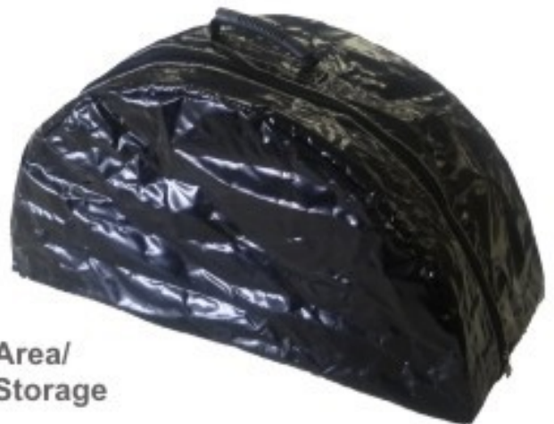
Carry Case Included