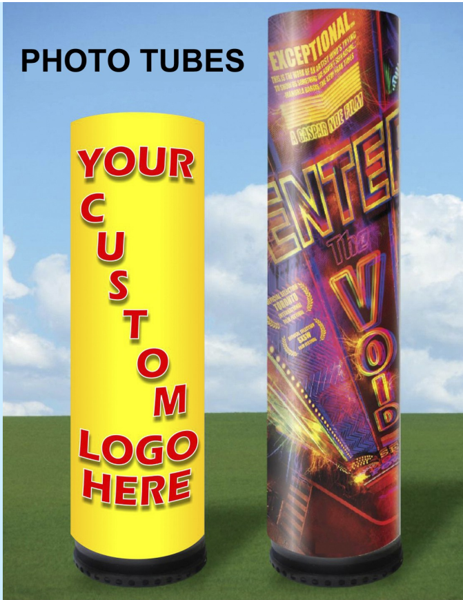
Air Vortex - Folding Base Fan System