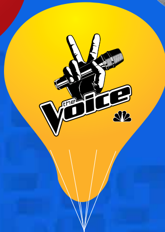
Hot Air Shape