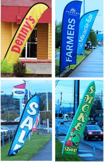
Leaning Flag Sets