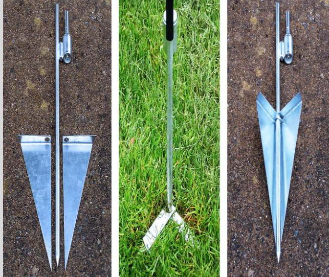
Ground Stakes with Braces